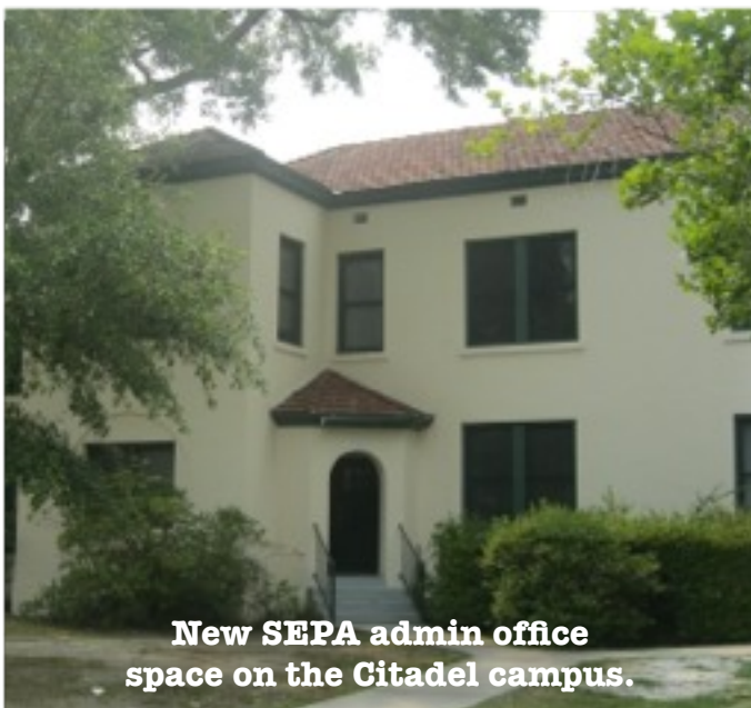
New SEPA admin office space on the Citadel campus.

As the new Administrative Officer, I welcome your input on how we can make the meeting better as well what you want to make sure we don't screw up!