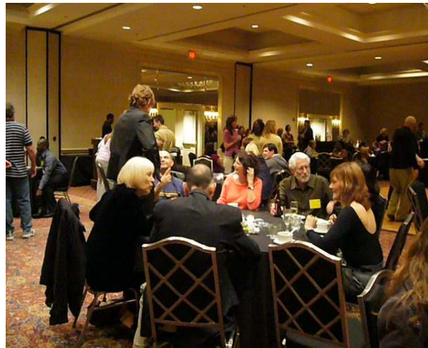
Scenes from SEPA Convention and festivities